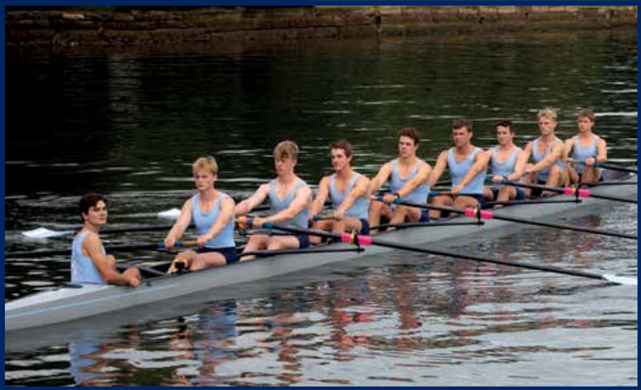
The King's School