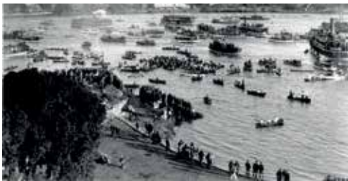
AAGPS Regatta circa 1920s

In the first "Fours" we were eliminated in the preliminary heats and in the Second "Fours" our representatives had to be content with fourth place.