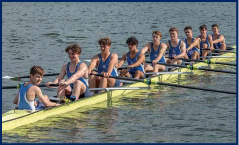
Saint Ignatius' College