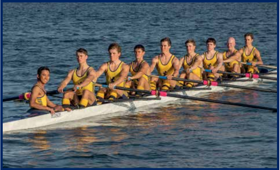
The Scots College