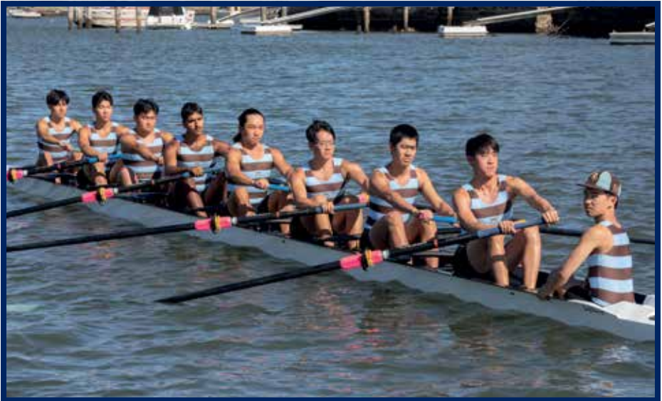
Sydney Boys High School