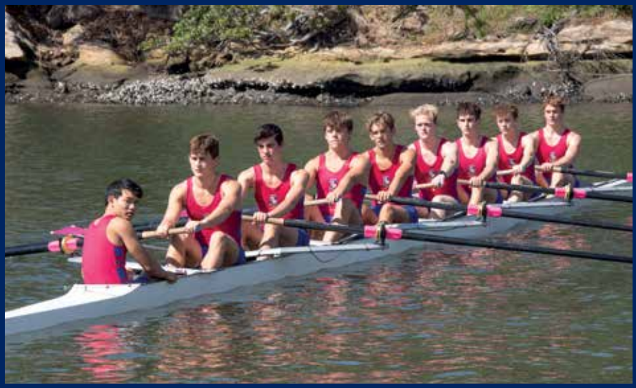
St Joseph's College