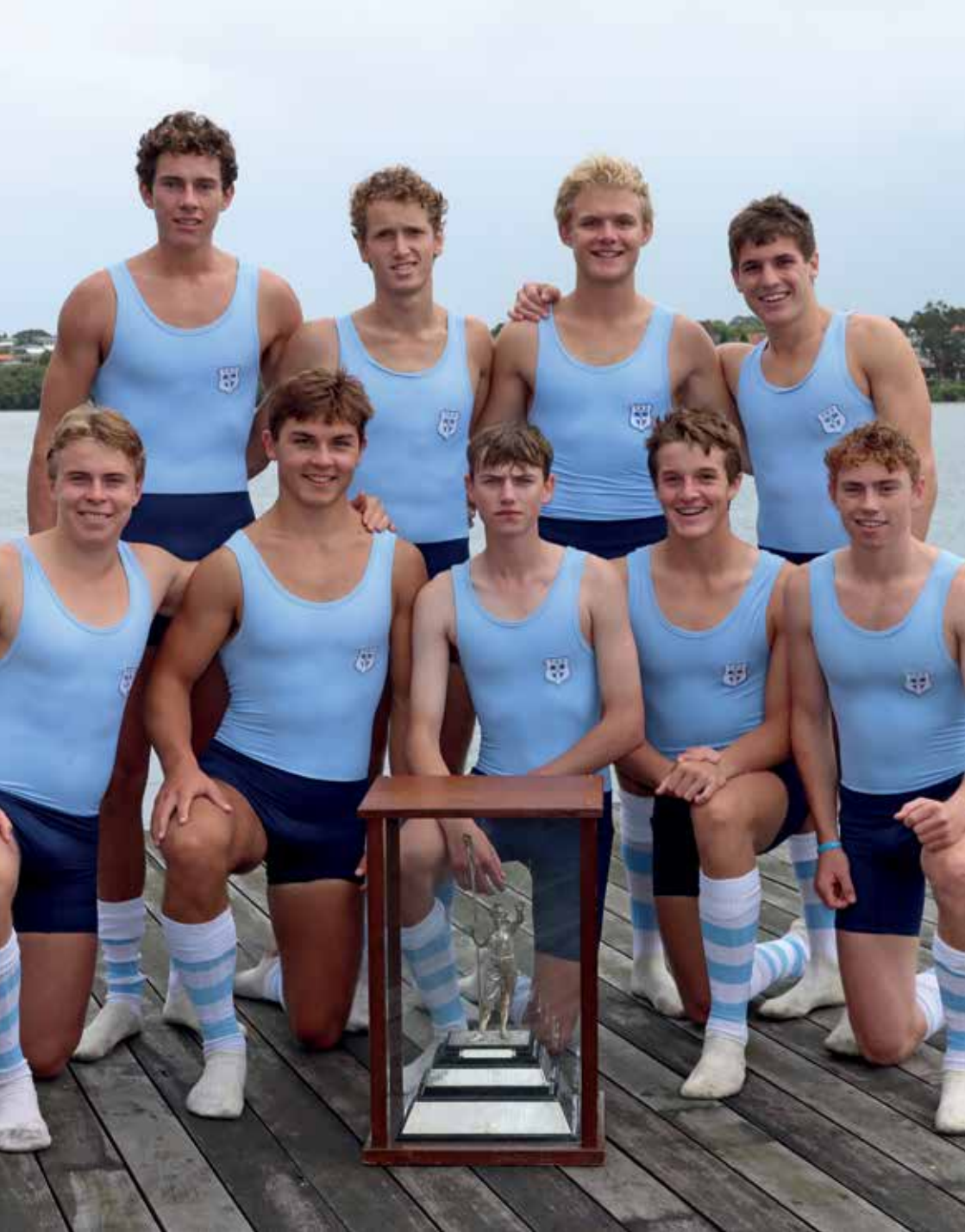
The King's School 1st V111, 2022 Winners of the Major Rennie Trophy