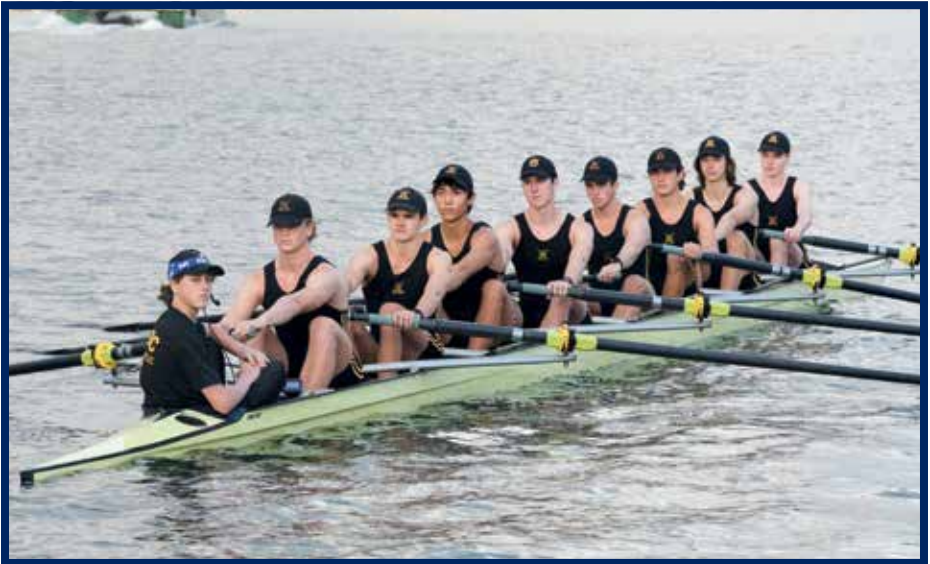
Sydney Grammar School